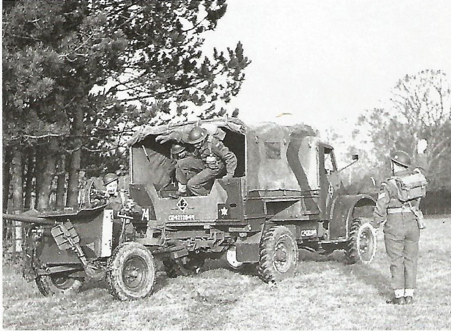
A 2-pounder gun has arrived on the gun position, and the detachment commander (standing) has ordered action. Note that the small size of the truck makes it difficult for the men to dismount quickly.

Cape Breton Highlanders, England, Spring 1941